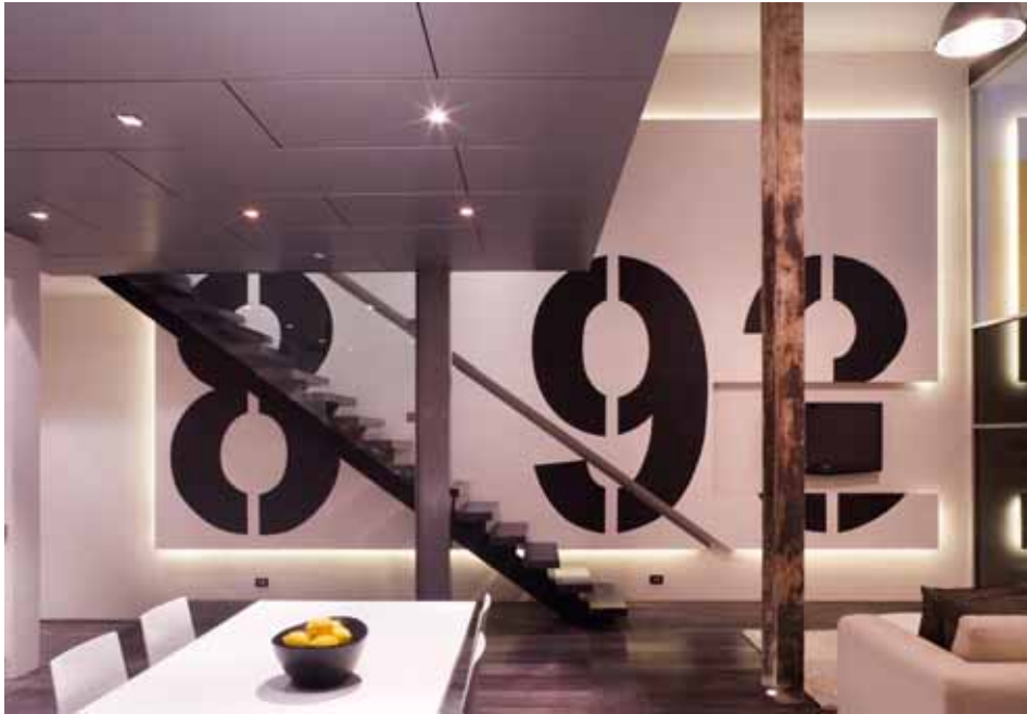
PREVIOUS PAGES: A butler's pantry is concealed behind the main kitchen, liberating the open-plan living and dining space from the usual kitchen clutter. THESE PAGES, ABOVE: An oversized wall graphic references the warehouse's industrial past. OPPOSITE: The formal lounge on the second level looks over the double-height main volume. A glazed garage alongside becomes a showcase for prized automobiles.

THERE IS AN OLD SAYING that I've always enjoyed hearing: "You can't make a silk purse out of a sow's ear." A literal reading would suggest that this is mostly correct – the ear is indeed one of the more unusual body parts. Conversely, a silk purse brings to mind shiny and compact and functional and beautiful. The impossibility of one being transformed into the other seems fairly logical.