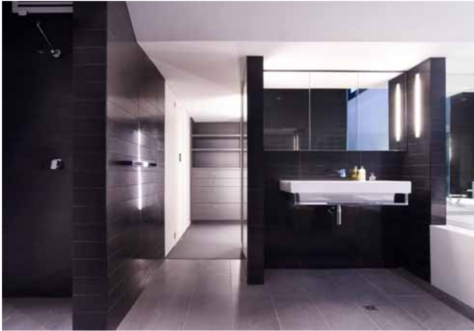
ABOVE: Beside the master bedroom, the ensuite leads past a small wine cellar to a walk-in robe. OPPOSITE: Rough-hewn materials have been used throughout. Open-tread stairs lead up from the main living space to the bedrooms, bathroom and study.

nestles alongside the formal lounge. It becomes an ideal vitrine for the sunshine-hued Lamborghini Gallardo Superleggera that crouches within, a shrine to big boy's toys.