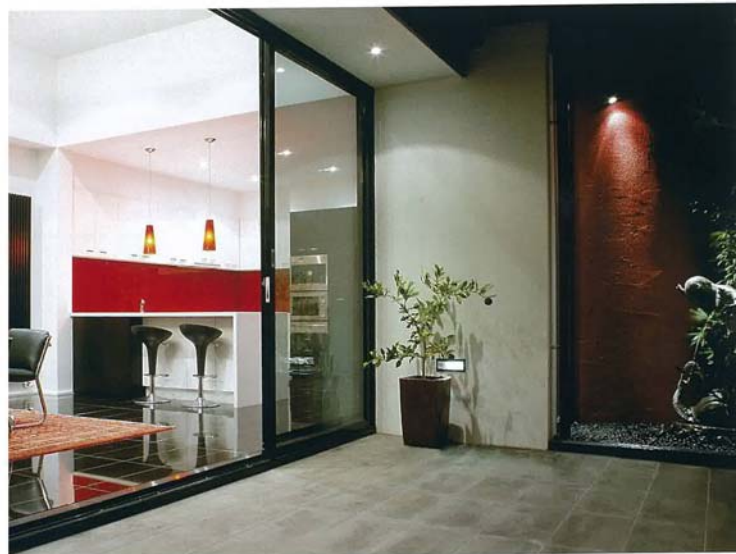
and opposite page The use of art and architecture buffered the client to feed both these needs when designing the house. The design varies within each specific zone and colours and subtle details are indicative of a room's function and purpose.

The 220m 2 dwelling comprises two living spaces, kitchen, study, three bedrooms, two bathrooms and a laundry. They are planned within four primary zones: first, a formal zone consisting of formal living area, study and library, where spaces are subtly delineated by floating walls and elevated floor planes; second, an open-plan informal living/dining/kitchen