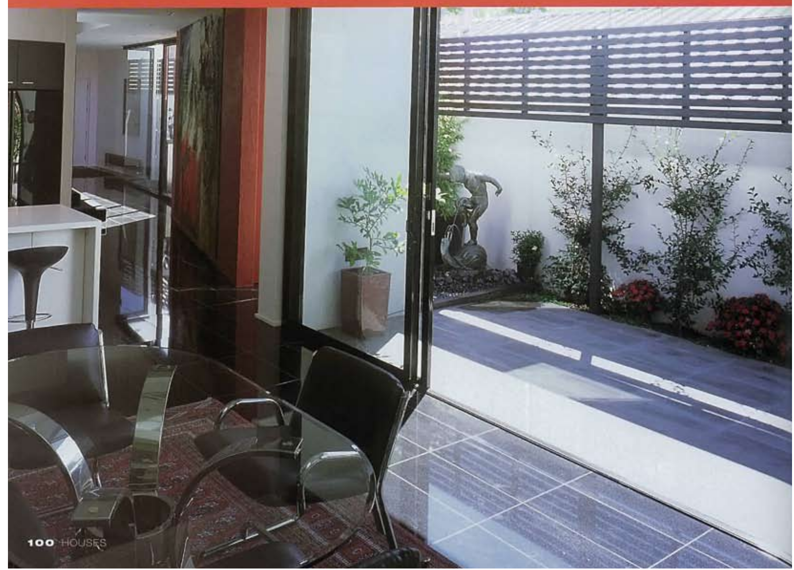
THESE PAGES, LEFT: Slender courtyard spaces on both sides of the site act as light walls. BELOW: The architect measured this tapestry version of Nolan's Path of Constable Scanlon many times over, then designed the wall to fit it perfectly. FOLLOWING PAGE: A glazed walkway leads into the sleeping wing.

In this project, David and his team have housed an imposing art collection in a building that also manages to work as a functioning residence. The architects have avoided the gallery-like sterility of vast white walls and instead – by controlling movement through the spaces – have revealed garden and street views while also devising a controlled sequence for the unveiling of artworks. The client's passion for the fine arts has been celebrated as a driving force. CHRISTOPHER MOORE