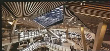
MYER FLAGSHIP NEW RETAIL EXPERIENCE, P.074