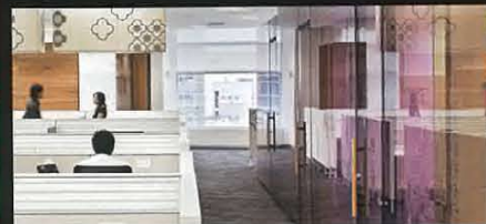
AMERICAN EXPRESS CELEBRATING LOCAL CONTEXT, P.110