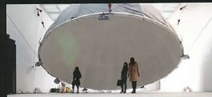
SHEN SHAOMIN A GALLERY AT HOME, P.068