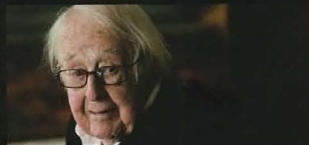
COL MADIGAN ISSUE 46 INDESIGN LUMINARY, P.060